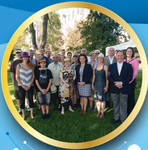
Victoria Symphony Splash Band of Heroes 2017